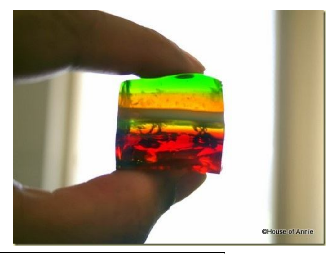
Image 1 ADA Description: jello layers backlit Caption: none Image file: jello_layers_backlit_thumb.jpg

Grade Level11 (9-12)Activity DependencyNoneTime Required60 minutesGroup Size3Expendable Cost per Group US$5.00Summary